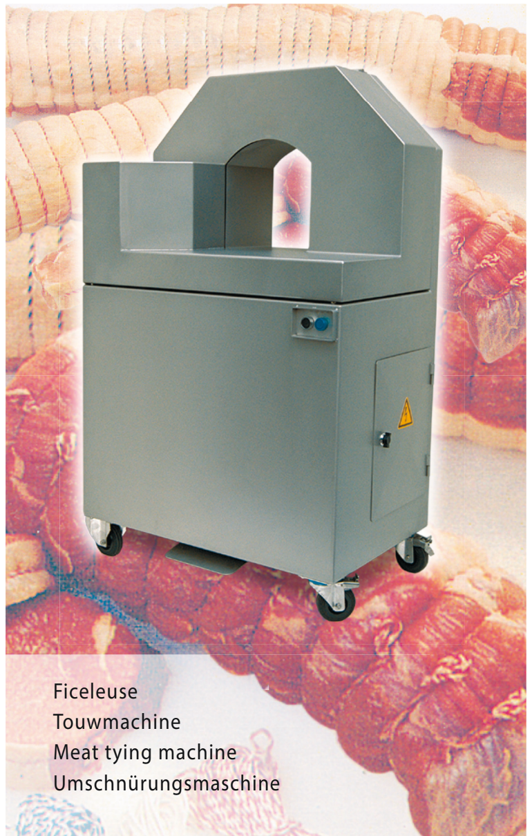
Ficeleuse Touwmachine Meat tying machine Umschnürungsmaschine